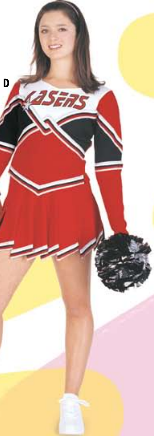
D. Body Shaper BLSLV-20S Solid Back $122.95 BLSLV-20 Front/Back Design $146.95 Shown in 3-point neck & metallic striping. All options available. Lettering Tackle Twill-Custom. Skirt SKAF161 $106.95 Angled hem, 16 pleat flier.