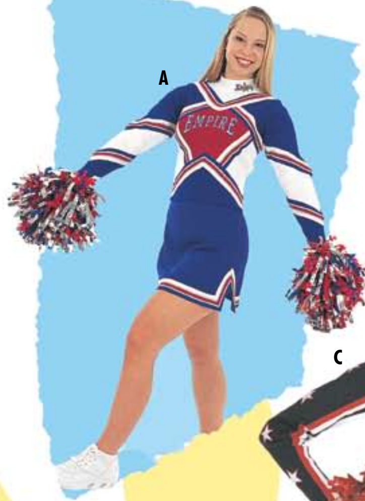
A. Body Shaper BLSLR-45S Solid Back $113.95 BLSLR-45 Front/Back Design w/side zip $180.95 Shown in mock turtleneck w/back zip, metallic striping & panel. All options available. Lettering Embroidery #BAB-2. Skirt SKAS3 $73.95 A-line w/side slits.