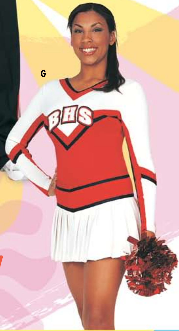
G. Body Shaper BLSLR-061S Solid Back $118.95 BLSLR-0610 Front/Back Design $129.95 Shown in v-neck & attached brief. All options available. Lettering Tackle Twill-Aachen. Skirt SKVWYK1 $105.95 Front/back v-waist v-yoke knife pleat.

Customize Striping • necklines Crop or Full Length Choose your fabric stretch poly rib knit or nylon spandex stretch flex