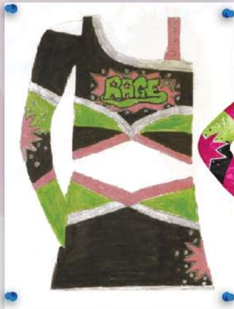
gulf breeze cheer, florida

Call now for professional assistance email/mail/fax us your original design for a price quote. Tel 800-749-9694 FAX 213-624-7704 broadwayaibion.com