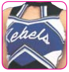
keyholes & cutouts