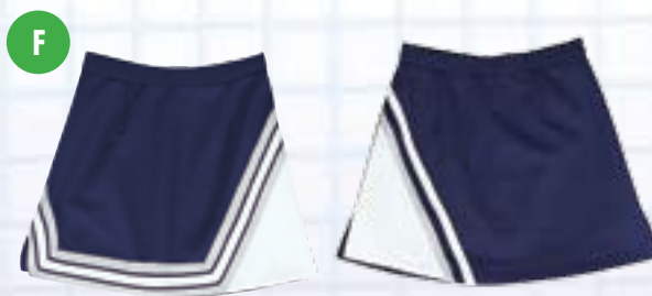
F. A-LINE W/ SIDE PANELS & SIDE SLITS SKASP1 $67.95 Bottom stripe around side slit SKASP2 $63.95 Single side panel stripe