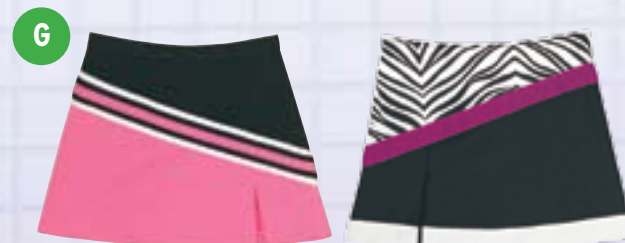
G. DIAGONAL YOKE A-LINE W/ HIGH FRONT SLIT SKVDAFS1 $73.95 Yoke stripe SKVDFAS2 $79.95 Yoke & bottom stripe