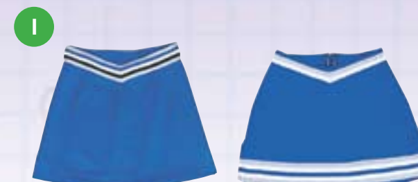
I. V-WAIST A-LINE W/ SIDE SLITS SKVWASO $61.95 Solid (not shown) SKVWAS1 $63.95 Waist stripe SKVWAS2 $66.95 Waist & bottom stripe