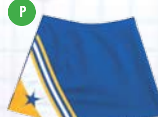
P. A-LINE W/ 2 COLOR SIDE PANEL & SIDE SLITS SKASP7 $68.95 Side panel stripe SKASP8 $73.95 Side panel & bottom stripe