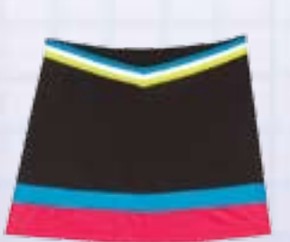
T. A-LINE W/ HIGH FRONT SLIT SKAFS1 $59.95 Solid (not shown) SKAFS2 $60.95 Bottom stripe