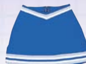
SKVWAS3 $78.95 Waist & bottom stripe around slits (not shown) SKVWAS4 $80.95 Waist, side & bottom stripe around slits (see pg. 70-B)