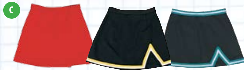
C. A-LINE W/ FRONT NOTCH SKAV1 $57.95 Solid SKAV2 $60.95 Bottom stripe SKAV5 $64.95 Waist & bottom stripe