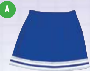
A. A-LINE SKA1 $59.95 Solid (not shown) SKA2 $60.95 Bottom stripe SKA3 $60.95 Side stripe (see pg. 20-B)