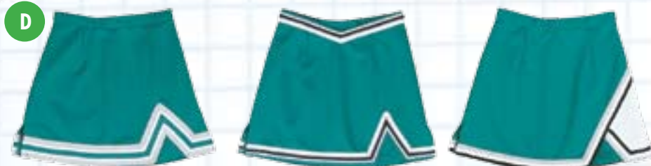
D. A-LINE W/ FRONT NOTCH & SIDE SLITS SKAVS1 $61.95 Bottom stripe SKAVS2 $66.95 V-Waist & bottom stripe