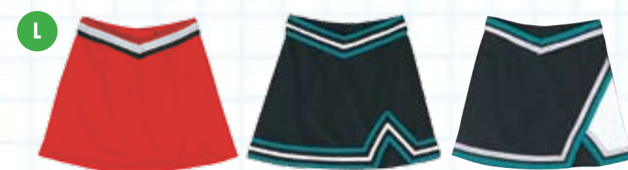
L. V-WAIST A-LINE W/ FRONT NOTCH SKAVWVO $58.95 Solid (not shown) SKAVWV1 $63.95 Waist stripe