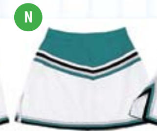
N. V-YOKE A-LINE W/ SIDE SLITS SKVYAS1 $73.95 Yoke stripe (see p. 62-B) SKVYAS2 $79.95 Yoke & bottom stripe