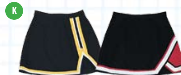
K. A-LINE W/ FRONT NOTCH SKAV3 $61.95 Bottom & front vertical stripe SKAV4 $66.95 Contrasting panel, stripe on panel & bottom