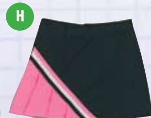
H. A-LINE W/ PLEATED SIDE PANEL SKASP3P2 $70.95 Side panel stripe