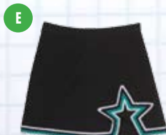
E. A-LINE W/ STAR CUTOUT SKASC1 $77.95 Bottom stripe SKASC2 $81.95 V-Waist & bottom stripe (not shown)