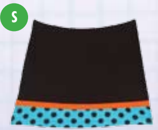
S. A-LINE W/ HEM PANELS & SIDE SLITS SKAS8 $67.95 Bottom stripe SKVWAS5 $72.95 V-Waist stripe