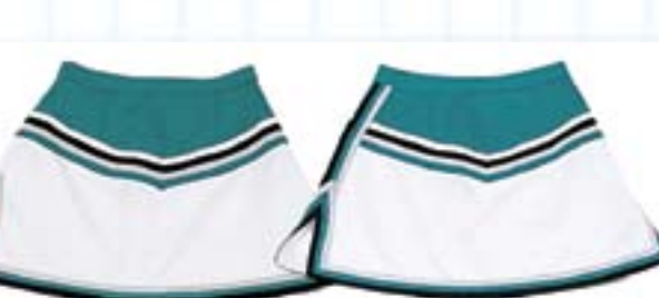
SKVYAS3 $81.95 Yoke & side stripe (not shown) SKVYAS4 $90.95 Yoke & bottom stripe around slits SKVYAS5 $92.95 Yoke, side & bottom stripe around slits