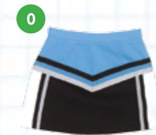
O. V-YOKE A-LINE W/ SIDE PANELS & SIDE SLITS SKVYASPS $85.95 Yoke & vertical side panel stripe