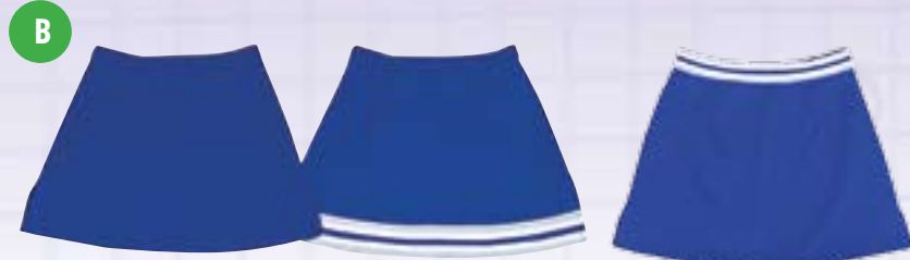
B. A-LINE W/ SIDE SLITS SKAS1 $60.95 Solid SKAS2 $61.95 Bottom stripe