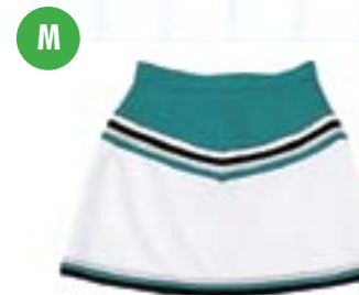
M. V-YOKE A-LINE SKVYA1 $73.95 Yoke stripe (not shown) SKVYA2 $78.95 Yoke & bottom stripe