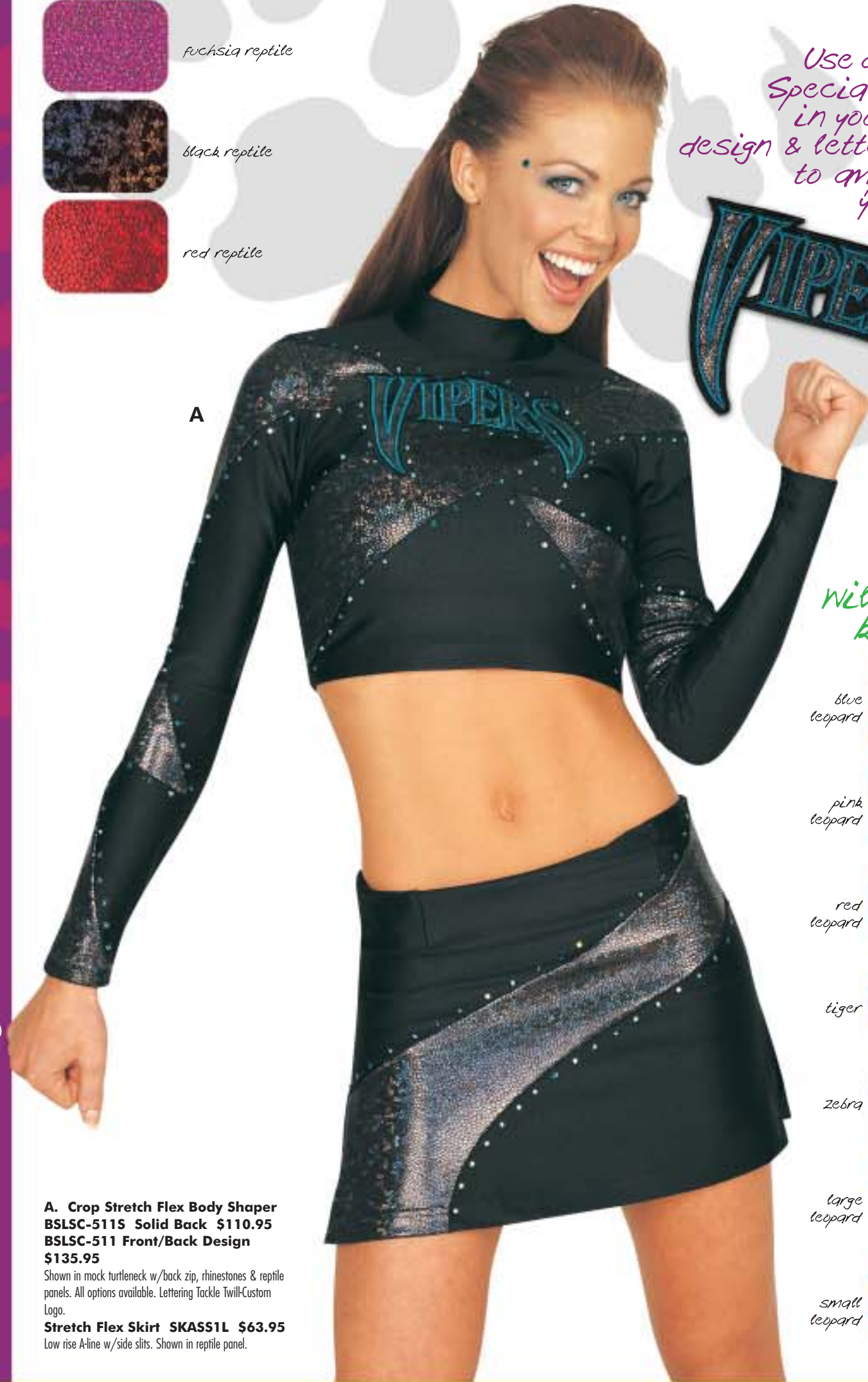
A. Crop Stretch Flex Body Shaper BSLSC-511S Solid Back $110.95 BSLSC-511 Front/Back Design $135.95 Shown in mock turtleneck w/back zip, rhinestones & reptile panels. All options available. Lettering Tackle Twill-Custom Logo. Stretch Flex Skirt SKASS1L $63.95 Low rise A-line w/side slits. Shown in reptile panel.

Use a Specialty Fabric in your design & lettering to amplify your look!