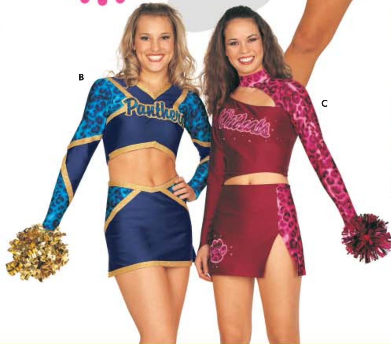
B. Crop Stretch Flex Body Shaper BSLSC-505S Solid Back $99.95 BSLSC-505 Front/Back Design $114.95 Shown in v-neck, metallic striping & blue leopard panels. All options available. Lettering Tackle Twill-Classic & #1PB. Stretch Flex Skirt SKVWAHP2 $75.95 V-waist A-line w/hip panels & side slits. Shown in blue leopard panels.

CUSTOMIZE STRIPING · NECKLINES CROP OR FULL LENGTH DESIGNS ALSO AVAILABLE IN POLY STRETCH KNIT BODY SHAPER FABRIC